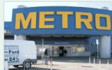
METRO Cash N Carry