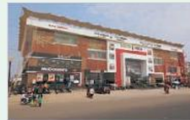
SOUTH INDIA SHOPPING MALL