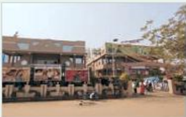
BHRAMARAMBA & MALLIKHARJUNA THEATRES