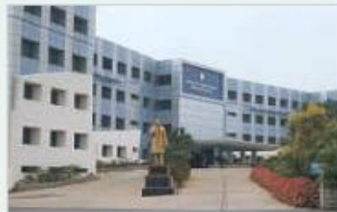
JNTU - KUKATPALLY