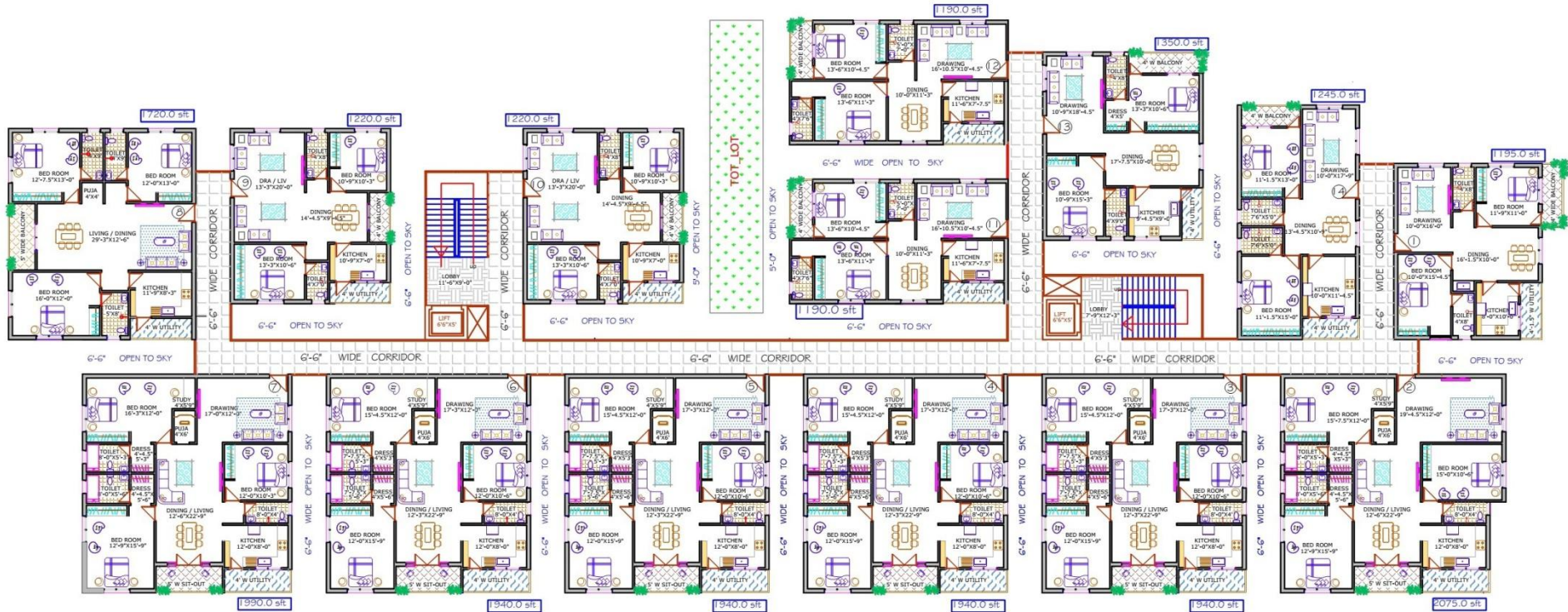
TYPICAL FLOOR PLAN (FIRST, SECOND, THIRD, FOURTH & FIFTH FLOORS)